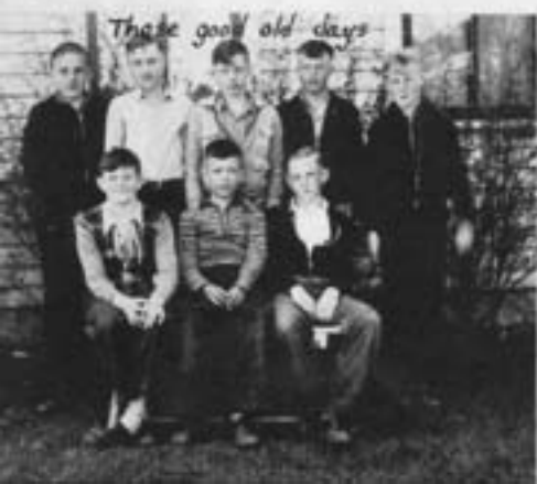
These good old days