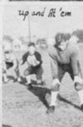
up and lit 'em