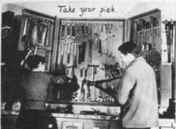
Take your pick