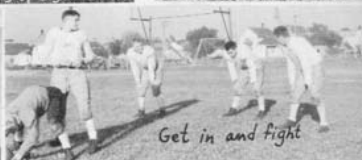
Get in and fight