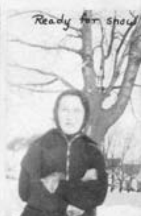
Ready for show