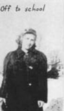
Off to school