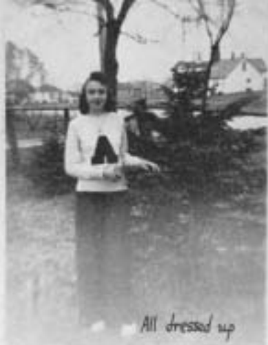
All dressed up