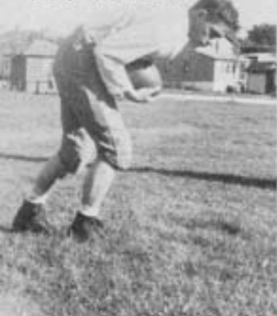
Hold that ball