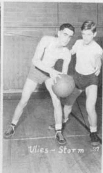
Ulies - Storm 27