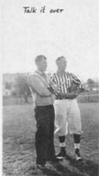
Talk it over