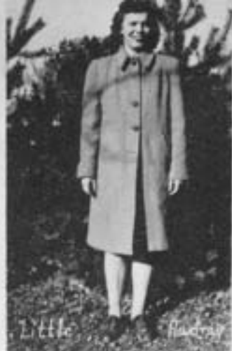
All dressed up