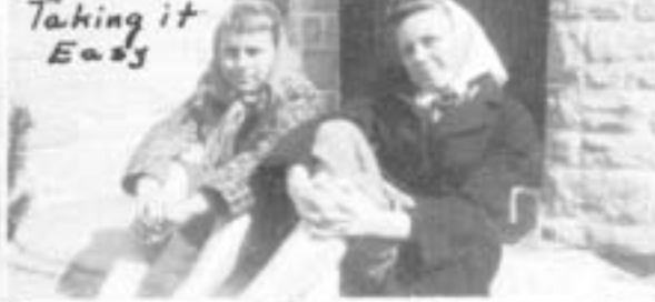
Taking it Easy