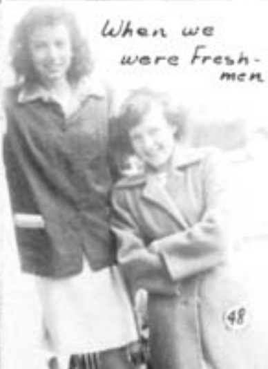
When we were Freshmen