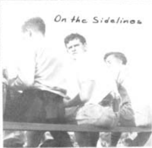
On the Sidelines