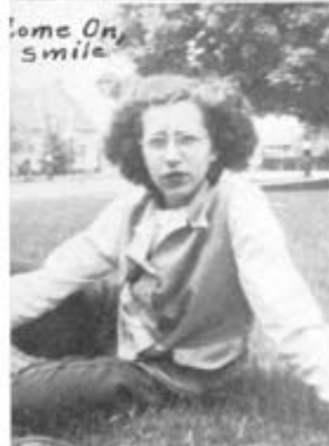
Come On, smile