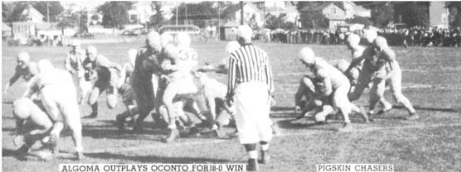
ALGOMA OUTPLAYS OCONTO FOR 18-0 WIN