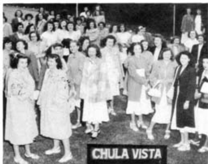
WISCONSIN DELLS F.H.A. CONFERENCE

The Golden Jug, a Homecoming traveling trophy, was awarded to the F. F. A. for the fourth time in seven years and the second time in the last two years. The real purpose of the F. F. A. can be summarized in its motto: "Learning to do, doing to learn, earning to live, living to serve."