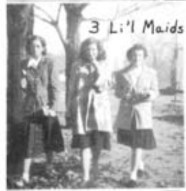
3 Li'l Maids