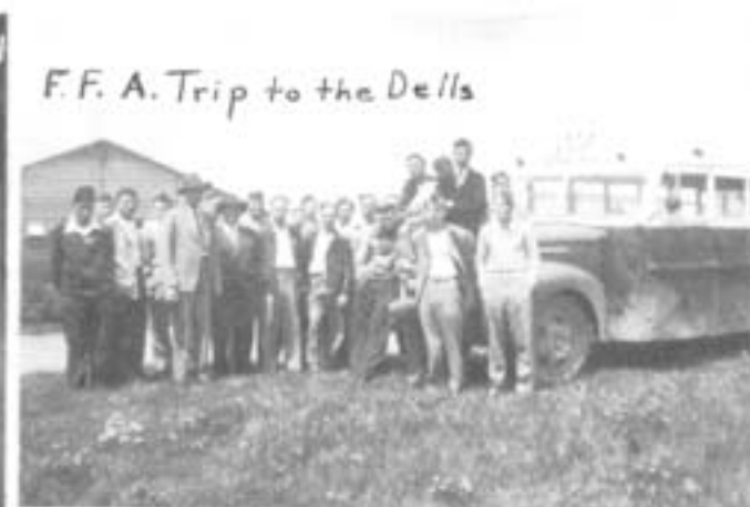
F. F. A. Trip to the Dells