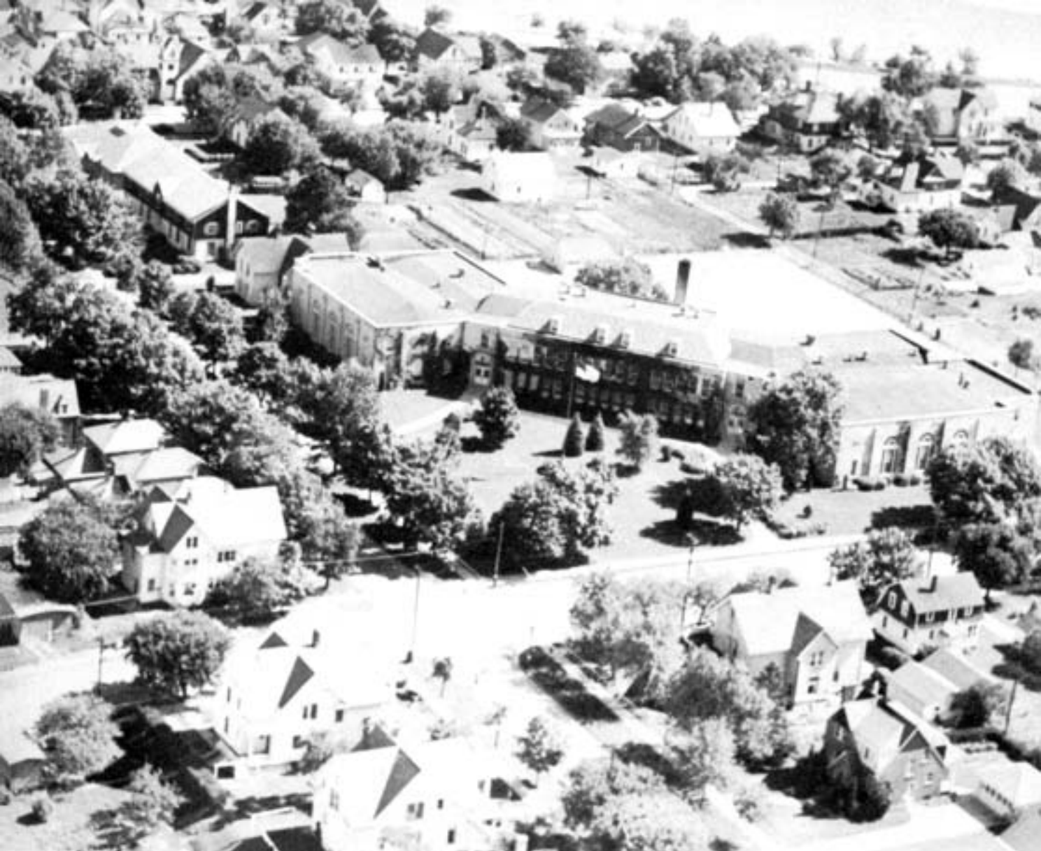
AIR VIEW OF ALGOMA HIGH SCHOOL