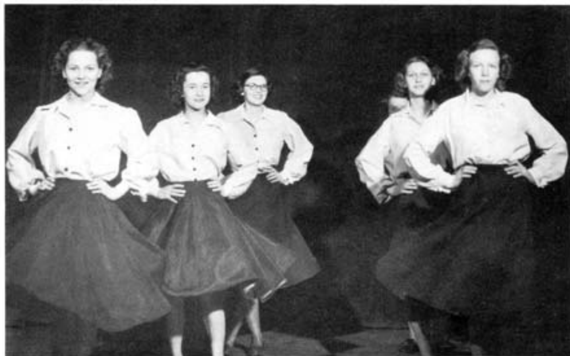
"ANOTHER SCORE FOR ALGOMA"