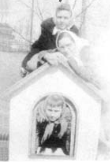
In The Doghouse